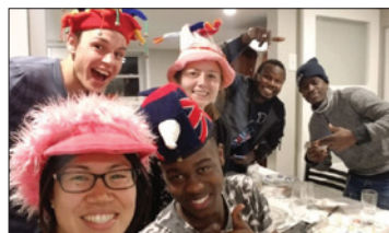
Welcome Home staff and residents Christmas 2018.

With no rental or credit history, finding housing is especially difficult for refugees. Staff help residents prepare a package with a reference from Welcome Home and a Canadian employer if they have a job. We support their independent search for housing and show them how to take public transit. This year, two refugee families and several singles successfully secured permanent housing.